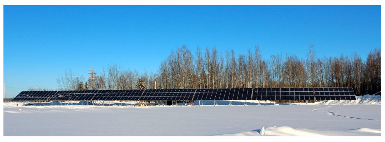
Figure 1: Fort Simpson is Northwest Territories Power Corporation's largest diesel-powered community. This 61 kW system (the largest north of 60° in Canada) will help displace 15 000 L of fuel annually and provide up to 8.5 % of the village's minimum power requirements during the summer.

The Northwest Territories developed a "Solar Energy Strategy 2012-2017"<sup>5</sup> that aims to displace 20 % of diesel-powered generation with solar PV in 25 diesel powered communities. The strategy includes development of a monitoring program that can be used to model PV production in northern climates.