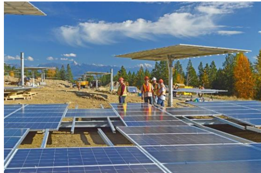
City of Kimberley's SunMine project

Learn more about sharing your images with us.