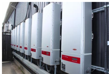
Fronius Canada inverters from a 200 kW installation in Erin, ON.

CanSIA is building up our archive of stock imagery of solar projects and we need the help of our Members. These images will be used in CanSIA marketing and promotional material, and will eventually be made available on our new website for use by the media and other stakeholders.